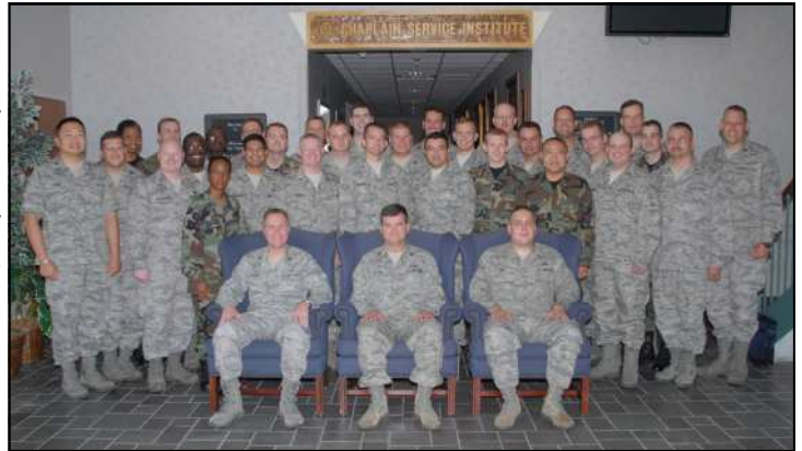
Basic Chaplain Course Class 09C, Summer 2009 - Maxwell AFB

At some point, I will receive an opportunity to deploy to an overseas air base for 30-60 days to minister to young men and women serving our country. As a priest and guard member, I cannot be compelled to deploy overseas, short of a total mobilization of the Guard—something that might only happen if World